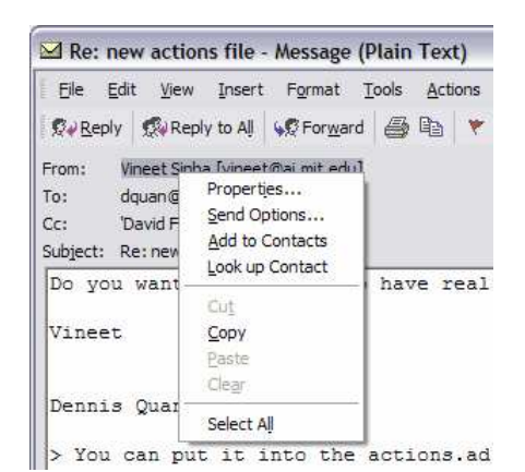
Figure 3. Actions for a contact name in the e-mail compose window (Microsoft Outlook 2002)