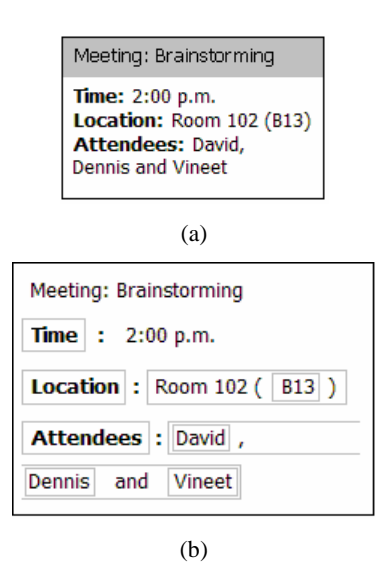
Figure 4. Example of nested views

Figure 4 shows an example of nested views: part (b) highlights the boundaries of the view selectors used to construct the piece of UI shown in part (a). The view for a meeting is built by embedding the views for the various meeting fields such as Time, Location, and Attendees. The value of the Location field is a Room object, which is rendered with a view. This view in turn embeds another view that renders the building "B13." Similarly, the view showing the collection of attendees embeds an inner view for each of the collection members. Note that the view for the collection is not rectangular: it flows like text onto more than one line.